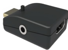
HDMI w/IR Adapter RX