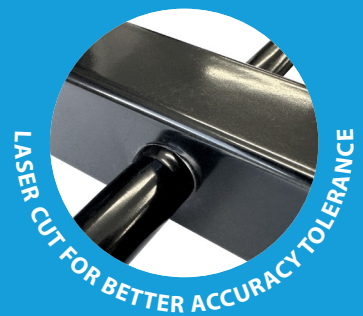
LASER CUT FOR BETTER ACCURACY TOLERANCE