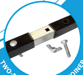
TWO-PIECE BOOM WITH JOINER