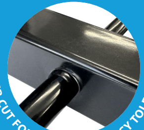
LASER CUT FOR BETTER ACCURACY TOLERANCE