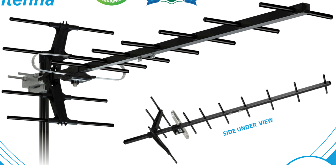
SIDE UNDER VIEW