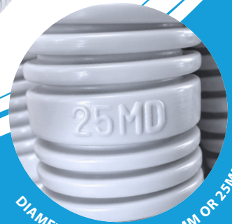
DIAMETER MARKINGS (20MM OR 25MM)