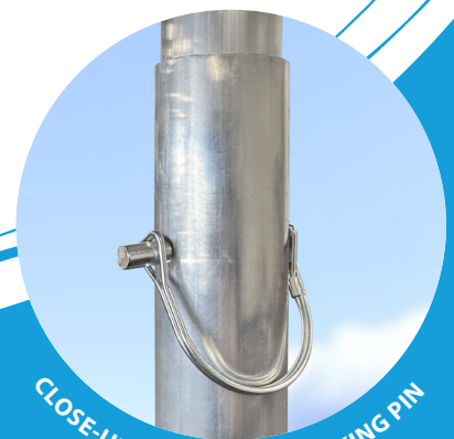
CLOSE-UP USING SHAFT LOCKING PIN