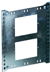
Mounting Bracket - Dual Wall Plate