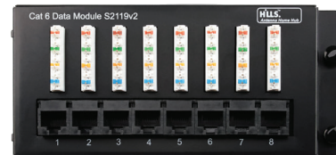
CAT6 Data Module