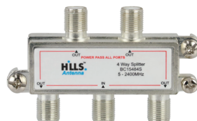
4 Way Splitter