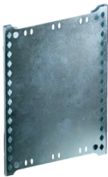
Mounting Bracket - Full Plate