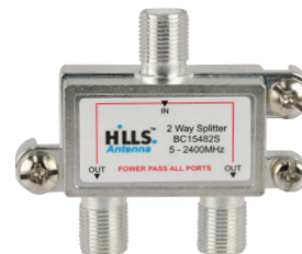
2 Way Splitter