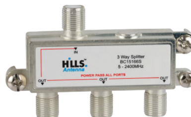
3 Way Splitter