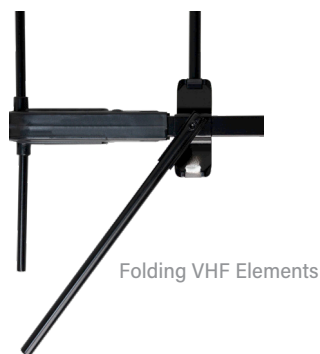
Folding VHF Elements