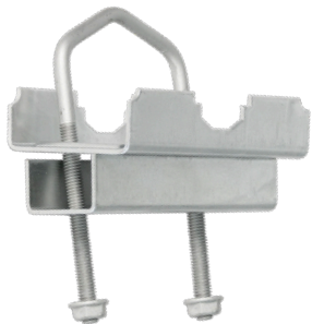
(V-Block & U-Bolt)